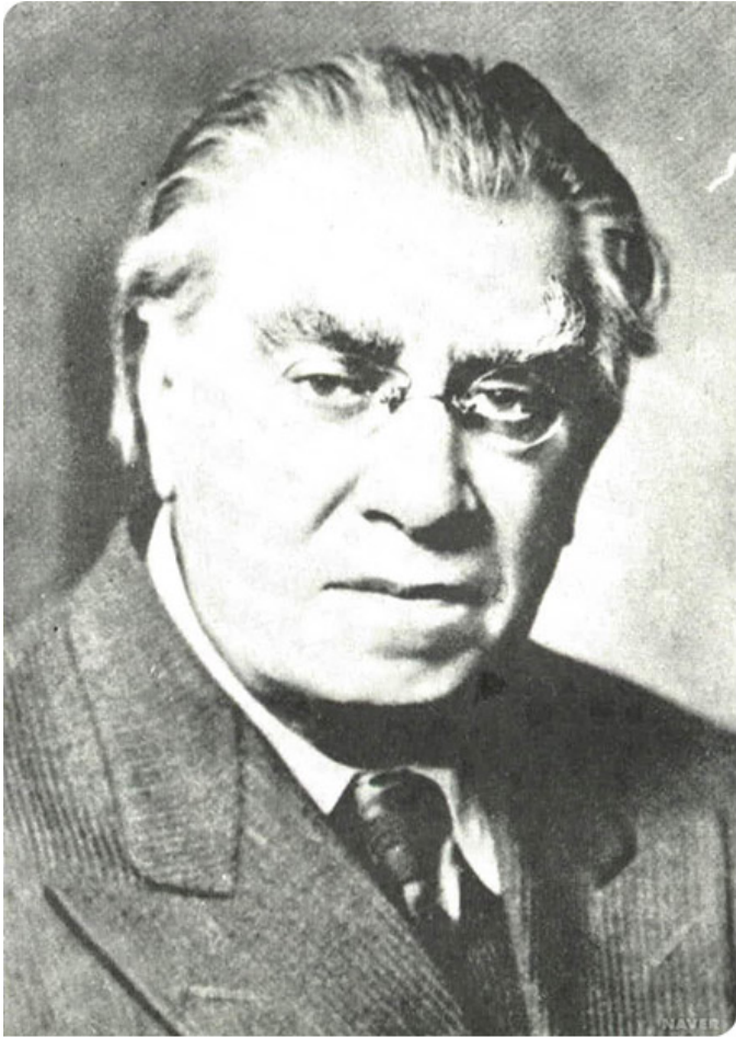
라인홀트 글리에르