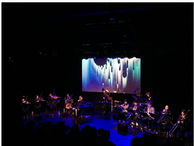
如何 如何 如何 如何 <K-PAZZ> , 如何 如何 如何, 如何如何, 如何, 2019