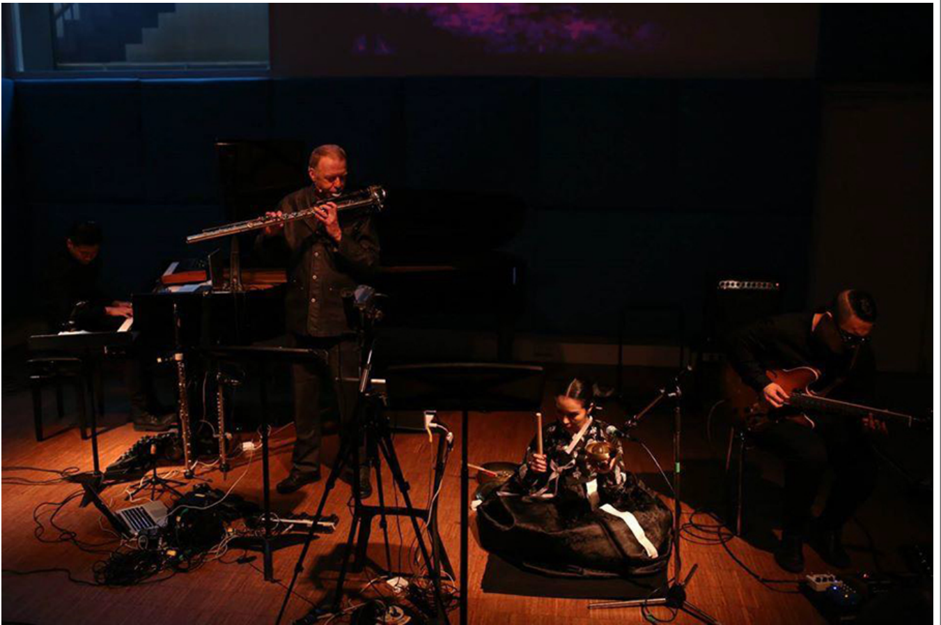
「 Ontogenesis 」のライブパフォーマンス <To See Eye to Eye>, 東京, 新国立劇場, 2015年