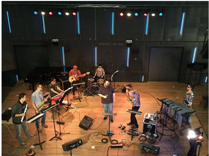
如何 如何 'Trazzionic' 如何, Amstel Kerk, 如何如何, 如何, 2015