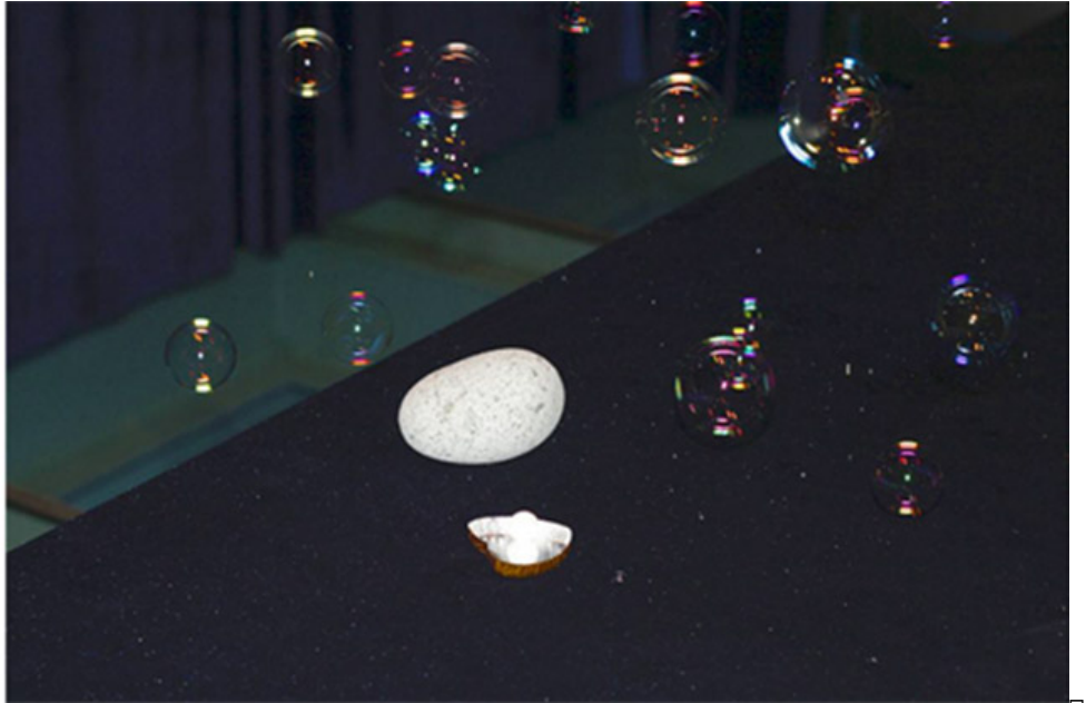
(Call)_30'00" _Boan (*Perform2017)_2017