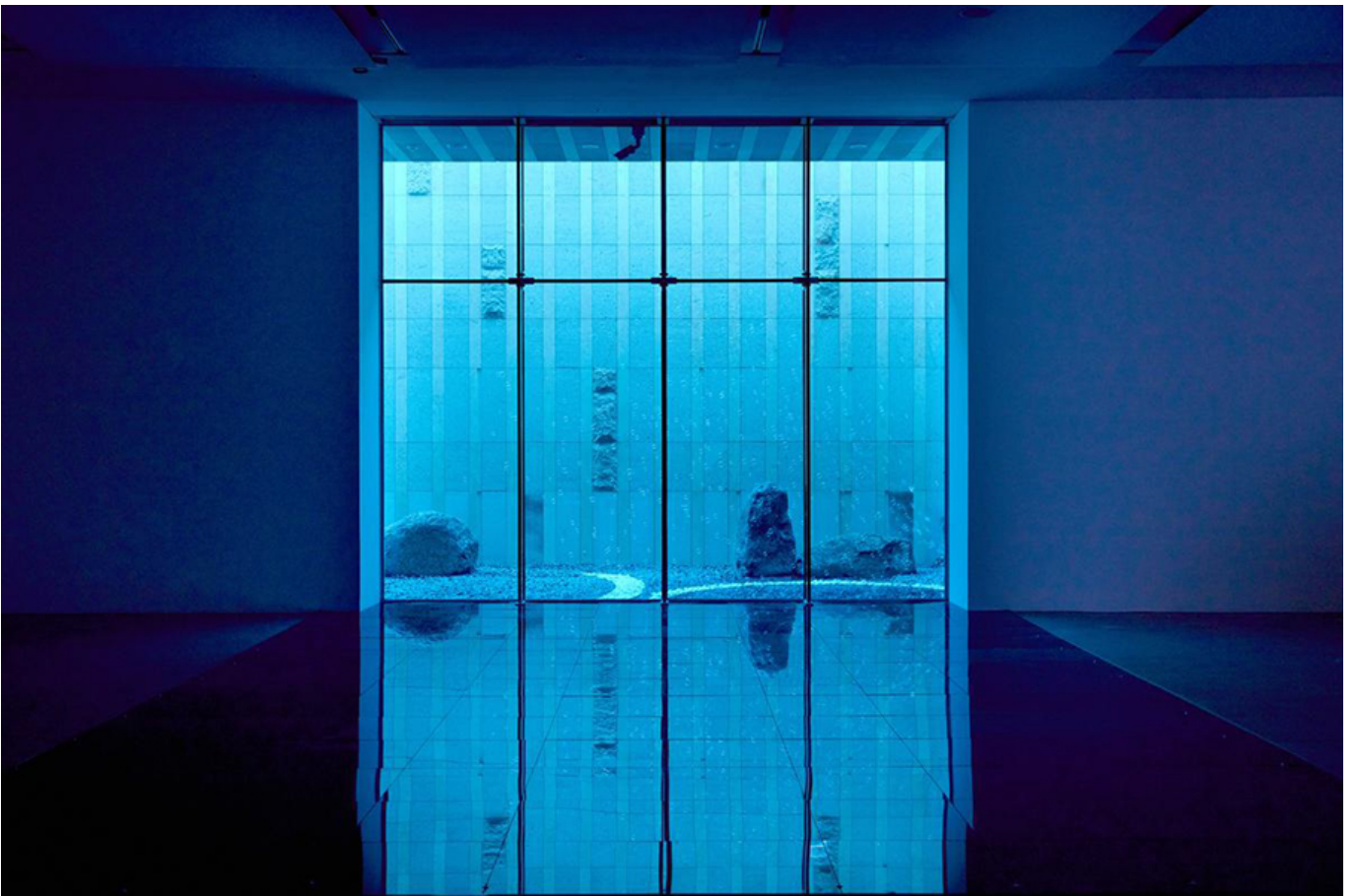
□□(Callback)_black ceramic tiles on the floor and the wall, window-tinting film, cut vinyl lettering on the window and on the wall, bubble machine_dimension variable_□□□□□□_2018