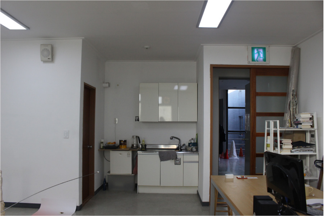
00 : 0000 000

00 00000 000 00 000 0 00 0000 0000 0000. 000000 00 000 00000 0 00 000. 00 00 000 00000 00 0000 000 000 00 000. 000 00000 000 00, 0.00, 0000 000 0000 000. 000 000000 00.000, 0000 00 000 00 0.