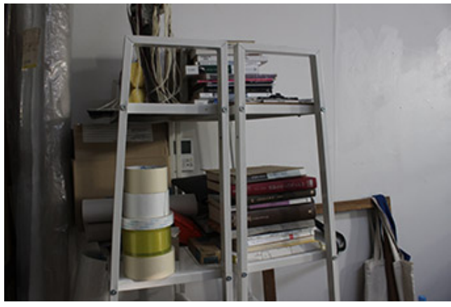
00 : 0000 000

0000 000000 000 0000 00 000 00 000000 000 0000. 0000 0000 0000 0 00 00 00 0000 00, 0000 0000 0000. 0000 000 000 0000000 00 000 0 0000000 000 0000000.