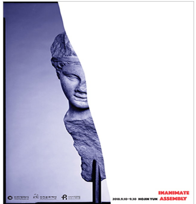
00 000 <0000000 0000(Inanimate Asembly)>

000 000 000 <Inanimate Assembly> 00000000 000000000 9 10(0)00 9 30(0)00 0000. 000 000 0 00 0000 Re:re: 0000 0000 000 0 00 '0000000 0000(Inanimate Asembly)' 0000. 0 000 00 00 0 000 00 00 000(000 0000 00 000 000)0000 0000 000 00 000 00 000 000 00, 000000 00 00 00 000 000.