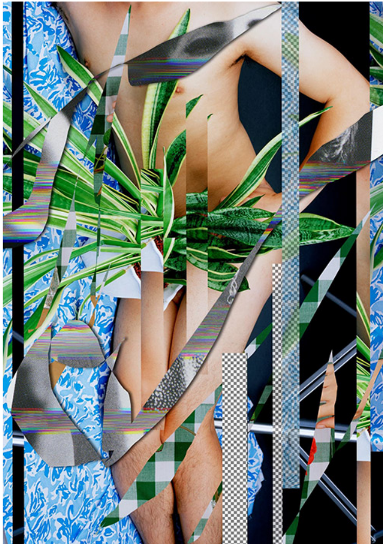
The Bather_000 000_27x33in_2015