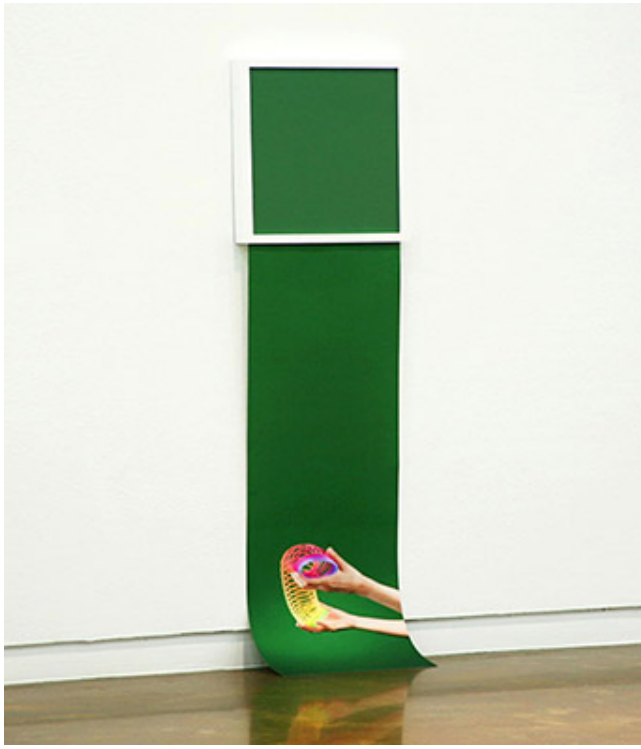
Over and Under_Hand cut wooden frame, Digital Print _30x150cm_2017