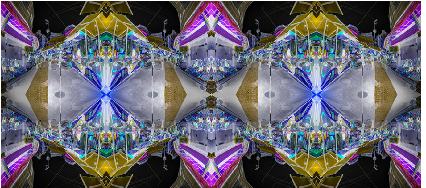
Repeat Stage No1_168x74.5cm_2018

Repeat Stage No1_168x74.5cm_2018. This artwork is a highly detailed, multi-layered mandala-like structure with a central vertical axis of symmetry. It features a rich palette of colors including deep blues, purples, pinks, yellows, and greens, set against a dark background. The design is intricate, with many small, repeating geometric and organic forms that create a sense of depth and movement. The overall effect is that of a highly detailed, multi-layered mandala or a complex architectural facade illuminated with vibrant lights.