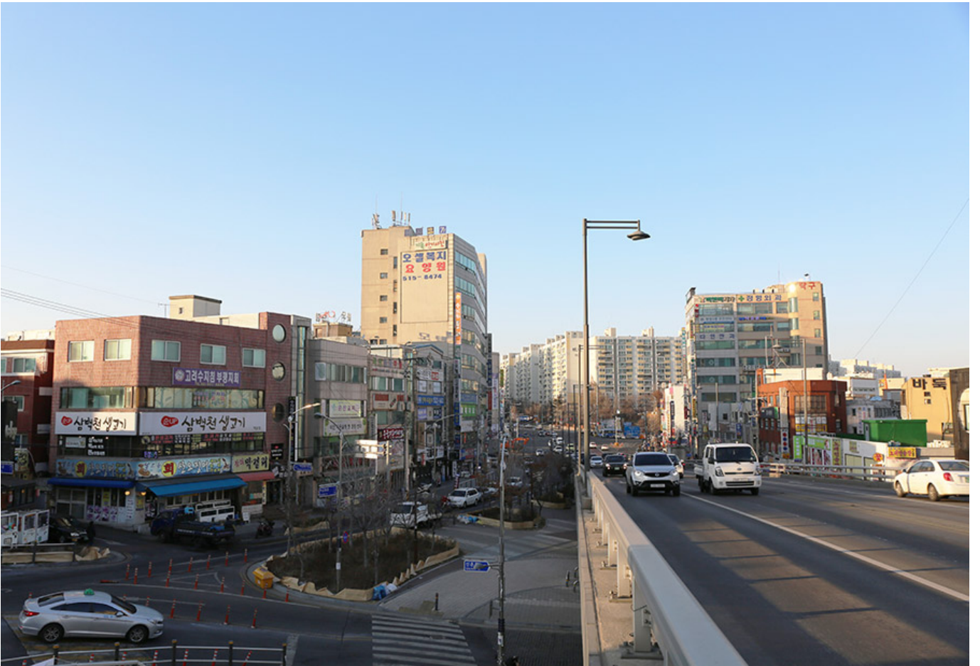
000_Sounds of the City in Bupyeong_2 000_000 00000_00_0000_2018

0000 00 00 000 00 000 0000. 00 00 00 000 000 000000 000000 0000 0 0000 0000000 00. 00 000 000 000 000 000 0000 000 000 000 00, 00 00 000 00 000 00000 00000 00 000 000 00. 0000 00 0 0000 00 00 0 00 000 000 00 000 00, 0000 00000 0000 0 00.